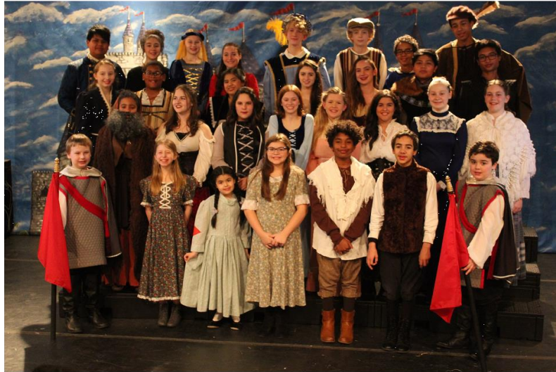
The Children's Theatre, Inc.