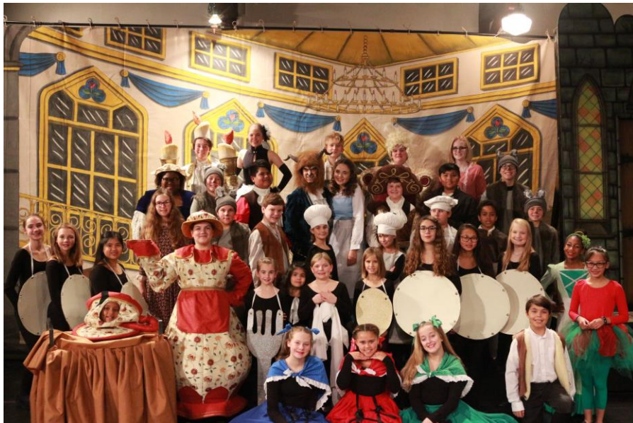
Beauty & The Beast Jr November 17 & 18 2018

We were delighted that DDA adjudicators gave us excellent marks for production and suggested that we incorporate a survey for measuring progress and for gauging audience response. In response to their recommendation, gift certificates were awarded to under-represented community members.